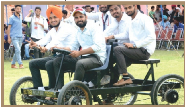
"Bolt Task" an epicycle made by Aryans Students