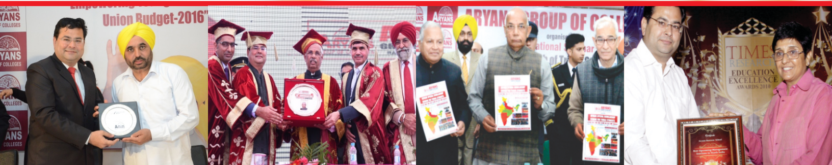
Sh. Bhagwant Maan Chief Minister, Punjab