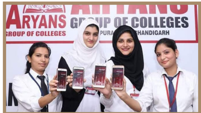
“Ramadhan App” developed by Aryans CSE Students