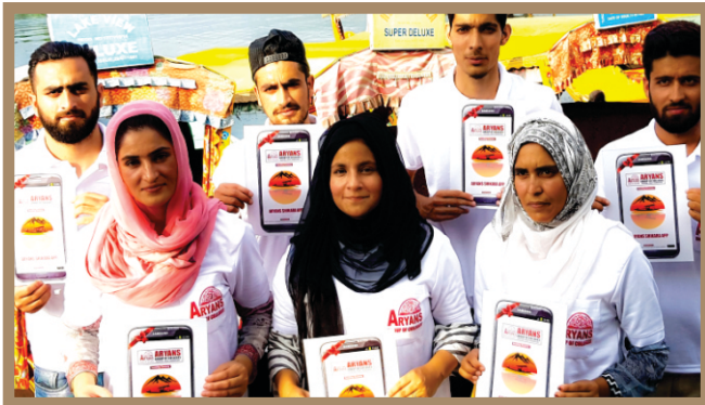
“Aryans Shikara App” developed by Aryans JK Students

Copyright Granted : Govt. of India granted Copyright to “Aryans Shikara App” developed by Aryans JK students. The copyright entitled “ Aryans Shikara App ” has been approved by the Copyright Office, Government of India, Diary Number 4191/2022-CO/SW, dated 23rd April, 2022. The App has been developed by JK Engineering students of Aryans to reduce the gap between Shikara owners and riders.