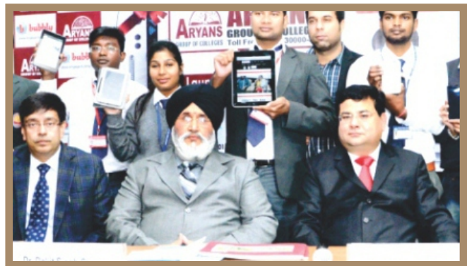
"Bubbly" Andriod App made by Aryans Students