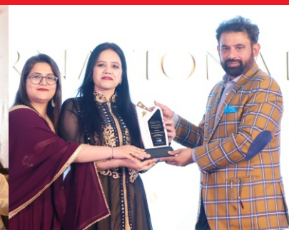
Sh. Chetan Sharma Ex. Cricketer & Indian Politician