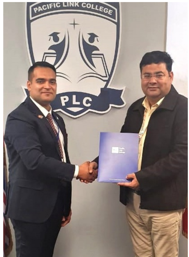
Pacific Link College