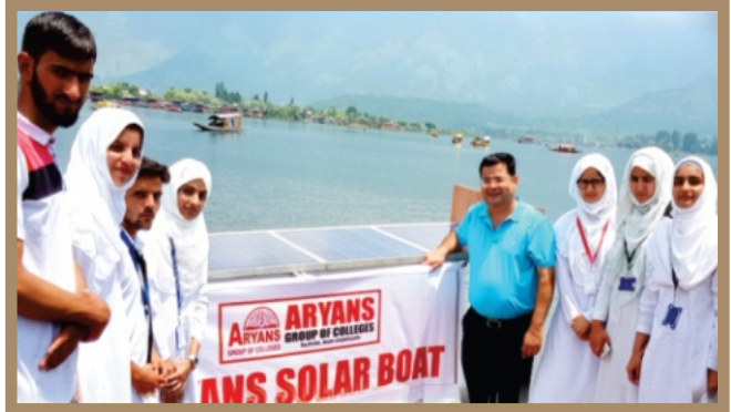
Solar Board Launched -by Aryans Students @DallLake