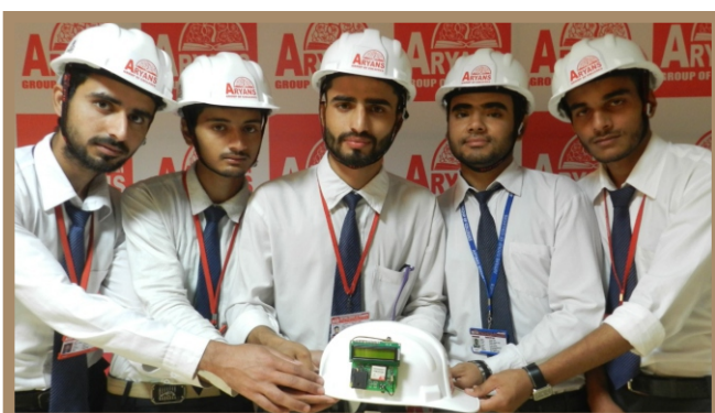
"Safety Helmet" made by Aryans Engineering Students