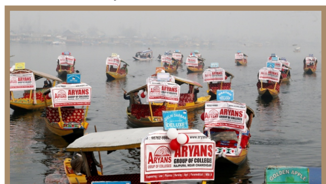
“Shikara Race” organized by Aryans