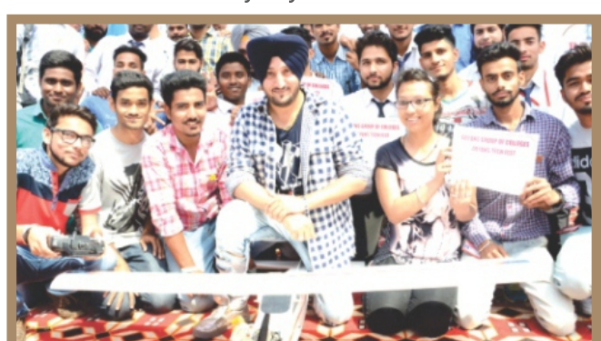
"Glider" made by Aryans Mechanical Students