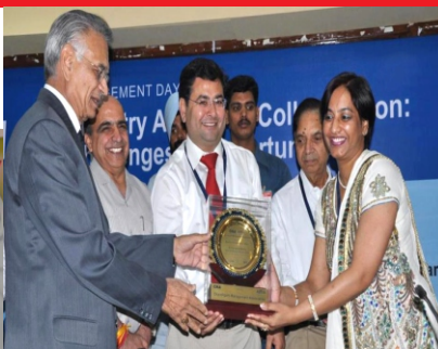
Sh. Shivraj Patil Former Governor, Punjab