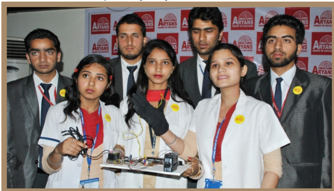
“Life Saving Gloves” developed by Aryans