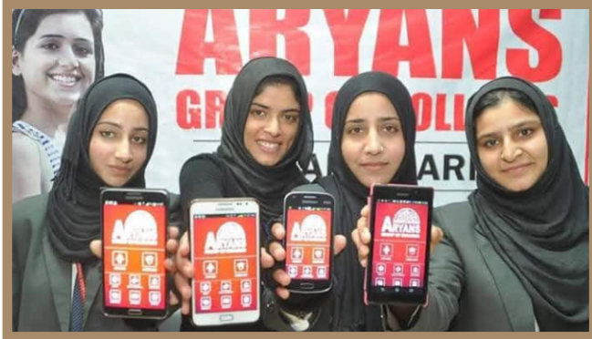
"Aryans Android App" made by Kashmiri Girl Students