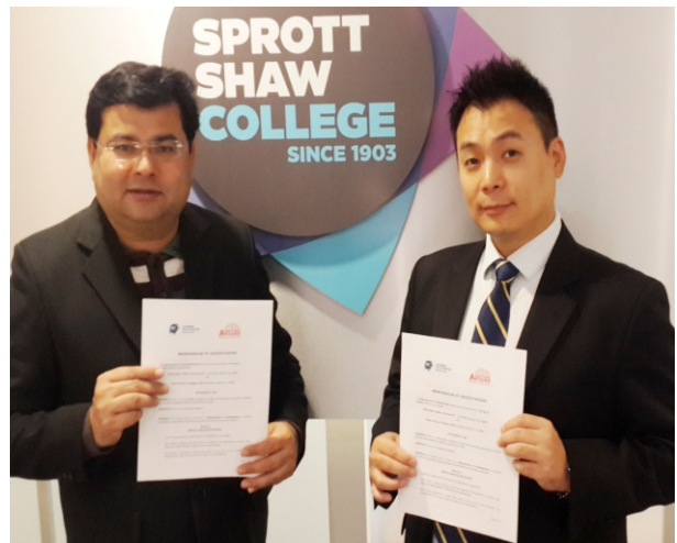
Sprott Shaw College