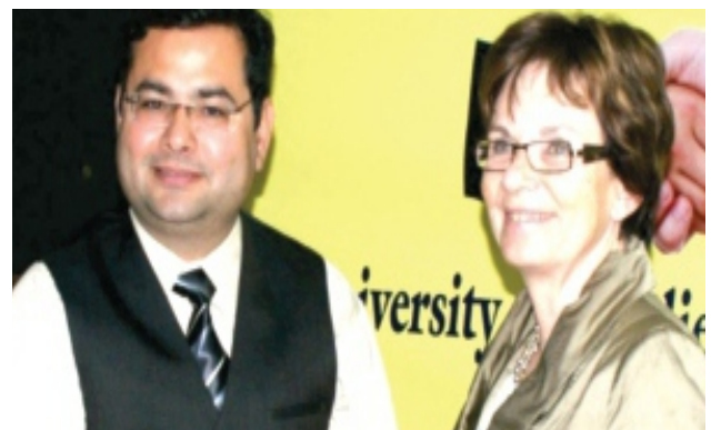
Fontys University, Netherland