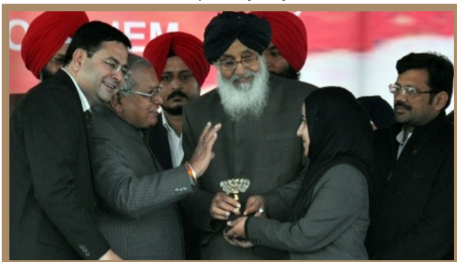
“Aryans Android App” launched in the presence of Late S. Prakash Singh Badal