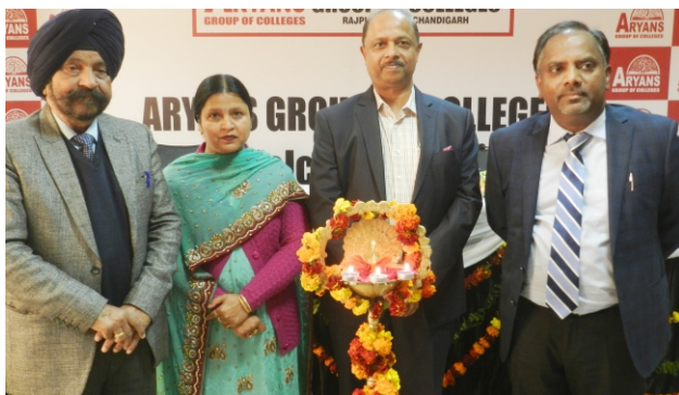
University of Fraser Valley