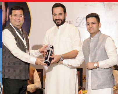
Sh. Gurmeet Singh Meet Hayer Cabinet Minister, Punjab