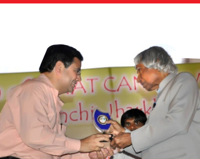
Lt. Sh. A. P. J Abdul Kalam Former President, India