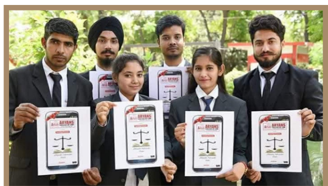
"eMunshi" App developed -by Aryans Engg. & Law Students